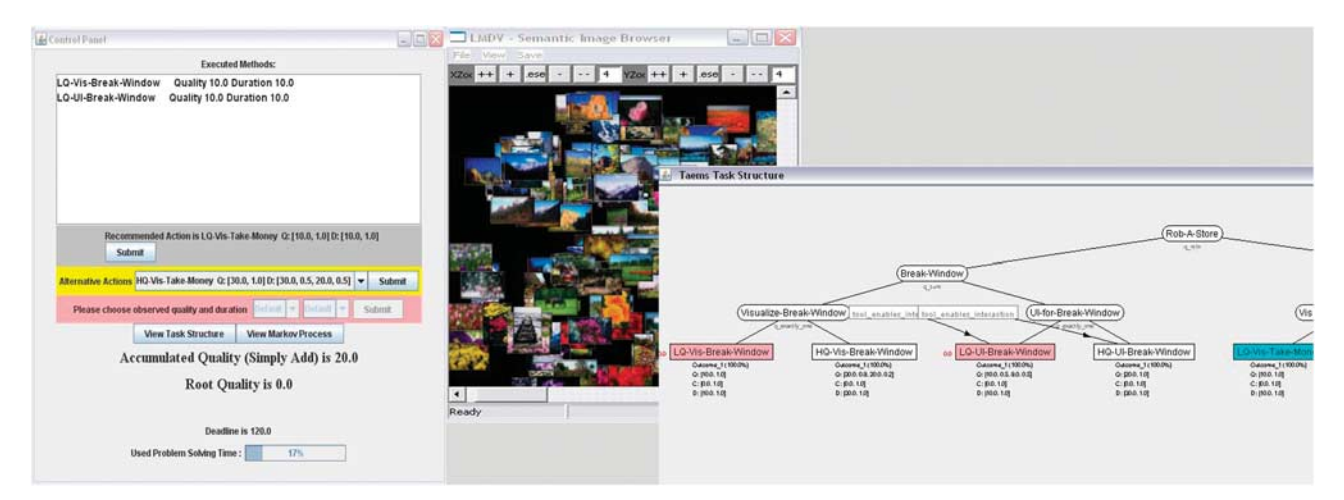
Figure 2: RESIN<sup>27</sup> interface for image browsing and analysis application. The control panel on the left is set for a task with a tight deadline. It sets the scale of imagery to be browsed in the center tool. The panel on the right updates information on real-time execution of subtasks so that the user can allocate time appropriately for completing the end-to-end task.

choosing the proper visual analytics tools for analyses<sup>13</sup> (see Figure 2). It relies on an artificial intelligence (AI) blackboard-based<sup>14</sup> software agent that employs interactive visualization, mixed-initiative problem-solving and time-series analyses to support predictive analyses from a particular viewpoint. (The blackboard architecture was developed to handle complex, ill-defined problems. In this case, a hierarchical system is developed with several agent-based knowledge sources for specific problem aspects. The blackboard is iteratively updated by the knowledge agent when its internal specifications match the current blackboard state.) The RESIN system enables analysts to explore large amounts of data in order to generate, track and validate multiple hypotheses in an uncertain environment. This general approach has been applied to some specific problems. For example, in terrorism event analysis, RESIN uses information from the National Consortium for the Study of Terrorism and Responses to Terrorism (START) Center's Global Terrorism Database<sup>15</sup> to match an event with a likely group or groups and to determine the threat level in a region in the near future based on past behavior of the group. RESIN is now being extended to also analyze sociocultural factors that could be significant in predicting behavior trends.