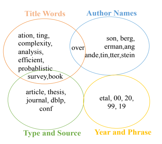
Figure 4: n-Grams Meaning Clusters

author names. To figure out the meaning hidden in a citation key, we adopt n-Gram analysis. We compute contiguous sequences of n characters from 304, 857 citation keys. Here n ranges from 2 to 10, and all citation keys are lowercased.